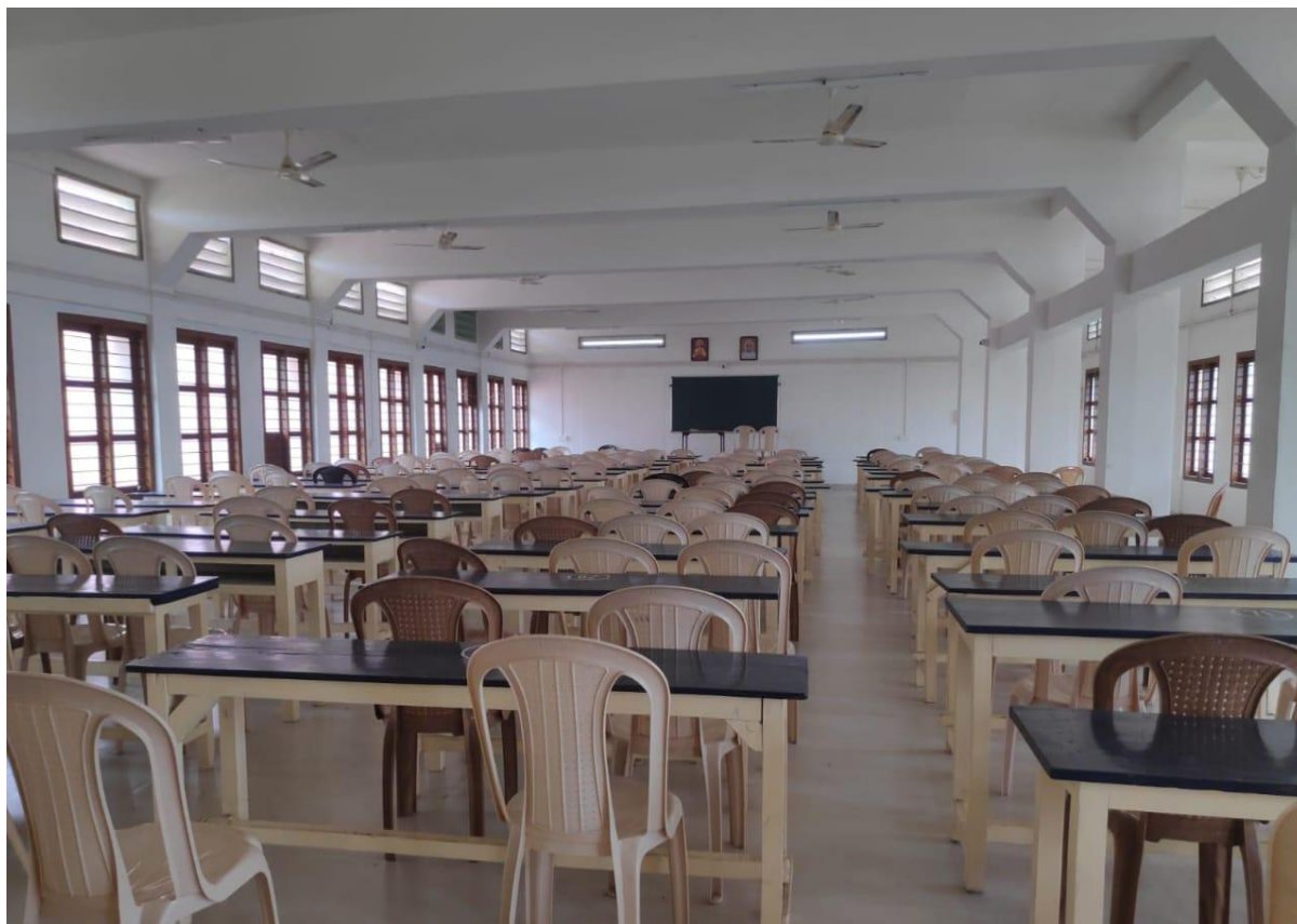
St. Chavara Hall