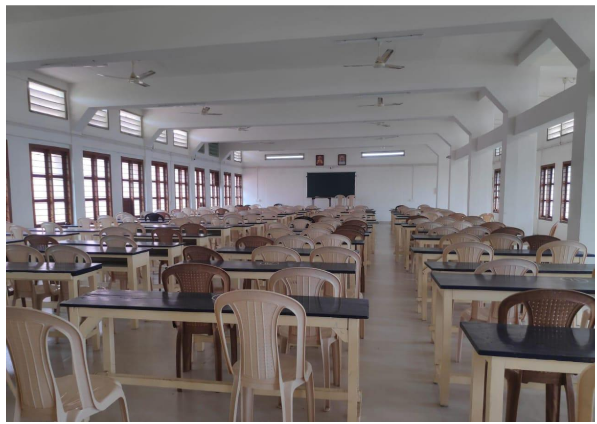
St. Chavara Hall