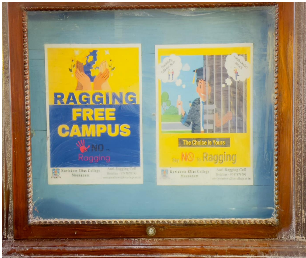
Anti-Ragging posters displayed in campus