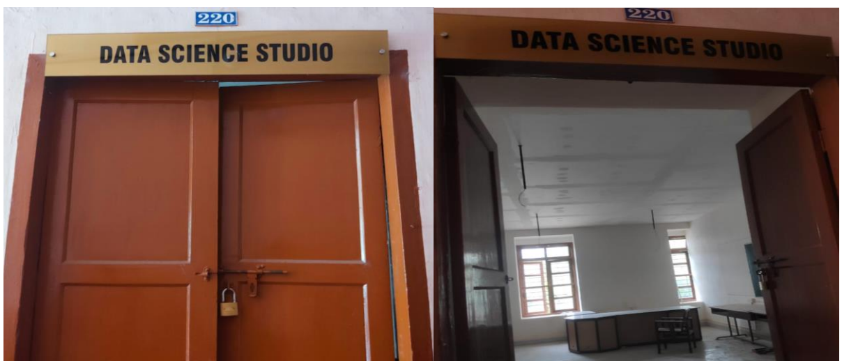
DATA SCIENCE STUDIO