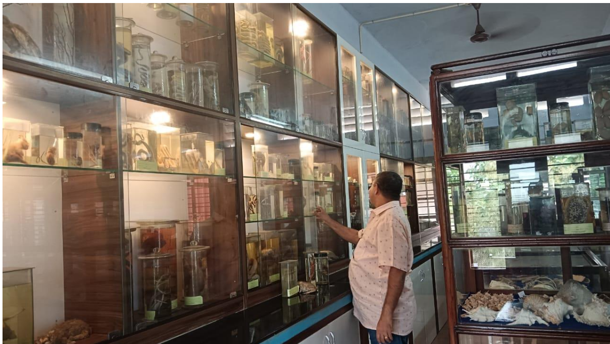
RENOVATION OF ZOOLOGY MUSEUM