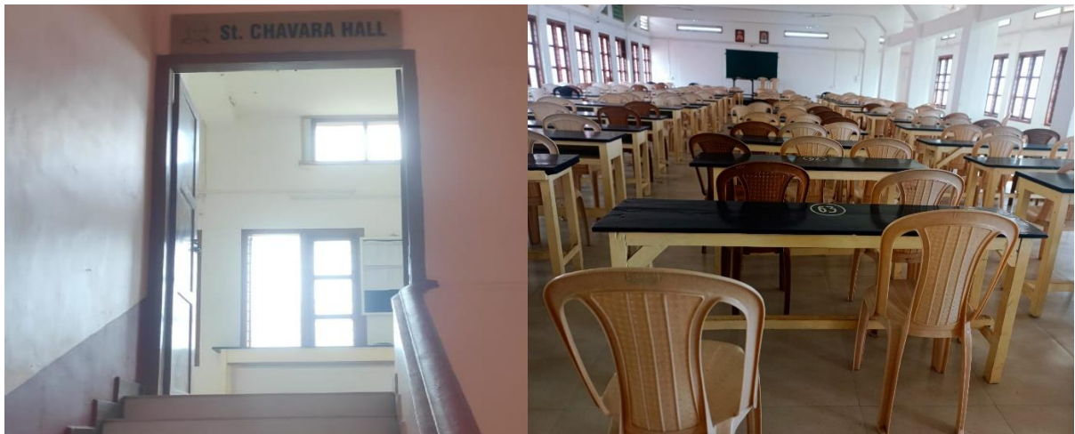
CHAVARA HALL - EXAMINATION ROOM