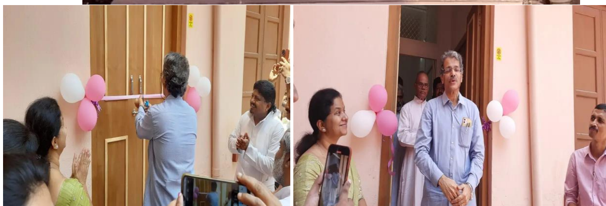
INAUGURATION OF K.E. MEDIA HUB