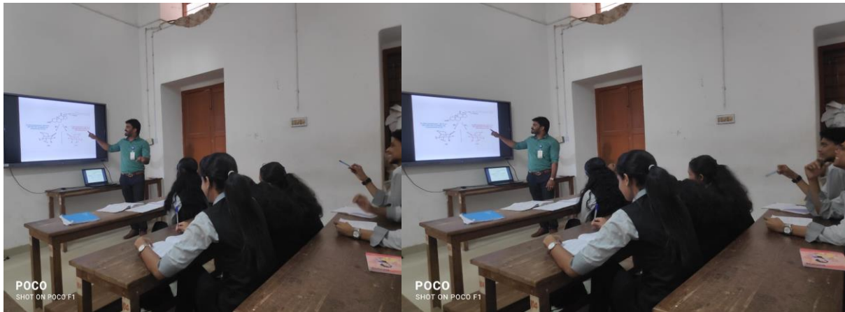
ICT ENABLED INTERACTIVE PANNEL - DEPARTMENT OF CHEMISTRY